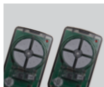
Two TrioCode™ 128 transmitters