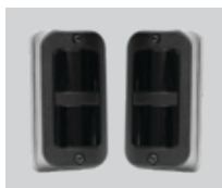
Wired Safety Beams